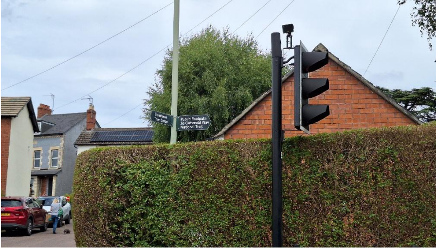
Already at lights on Upper Queens road. Very insignificant and easy to miss

And we might also want to do signs from the canal at St Cyrs as well, but I haven't mapped those in yet. Stage 2 perhaps????