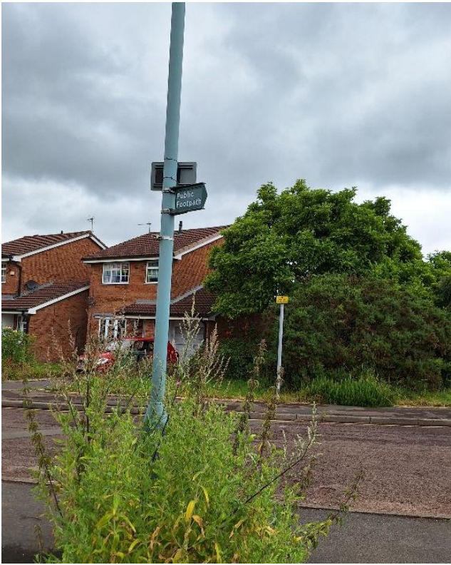
Already along Rosedale at start of houses and railway path. Even more insignificant!